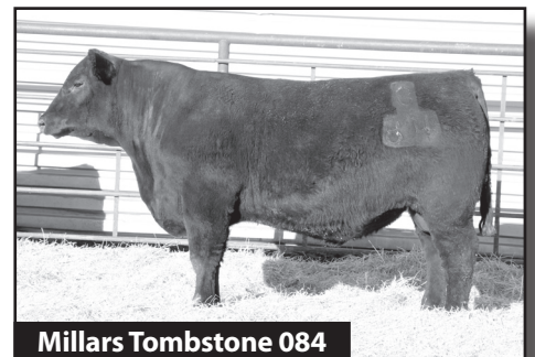
Millars Tombstone 084