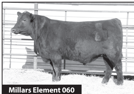
Millars Element 060