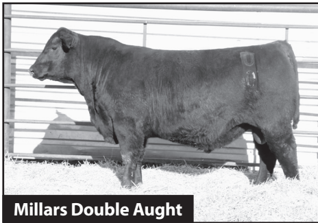
Millars Double Aught

We're excited to present you with this year's bull offering. Here's a sneak peek at a few of the bulls that will be offered for sale.