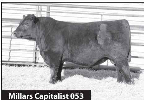
Millars Capitalist 053