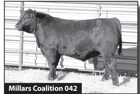
Millars Coalition 042