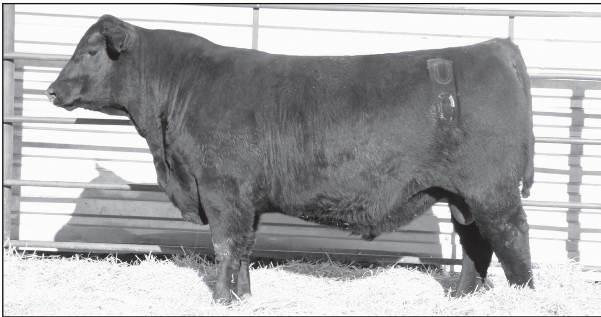
Herd Sire Prospect! Millars Double Aught (Millars Duke 816 x Connealy Capitalist 028 daughter)

Join us for our annual bull sale Wednesday, February 17 th , 1:30pm at the ranch