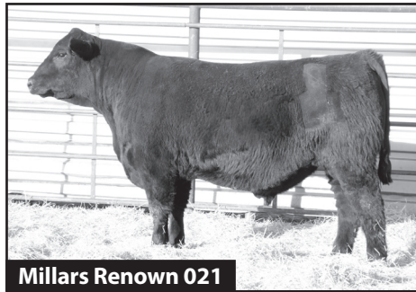
Millars Renown 021