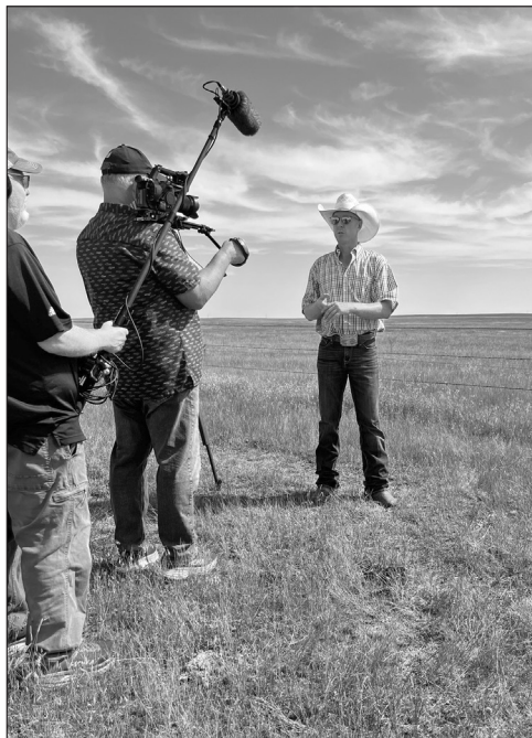
Smile...you're on camera! A camera crew was on hand taking footage to be used in Japan to promote US Beef.